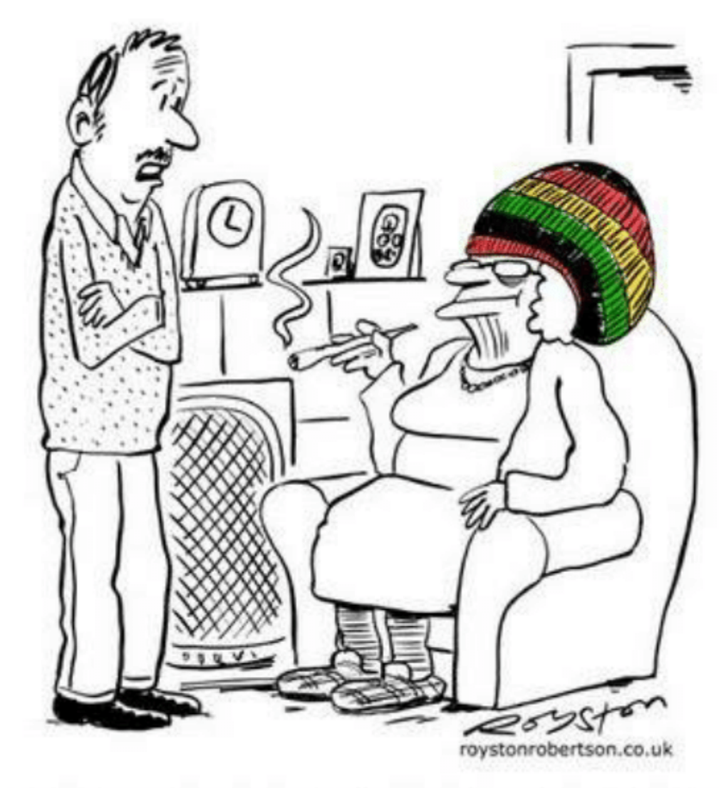
"Mother, are you sure your marijuana use is purely medicinal?"